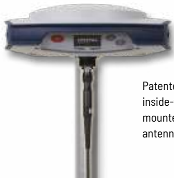
Patented inside-the-rod mounted UHF antenna design